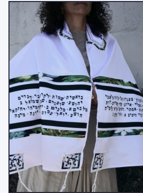
39 NAMES -GREEN