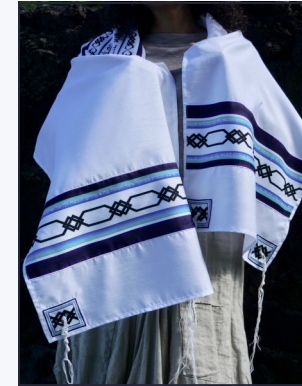
FRINGES OF LIFE