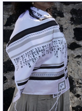
54 PORTIONS BROWN