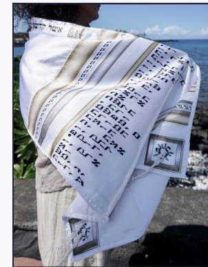
54 PORTIONS GOLD